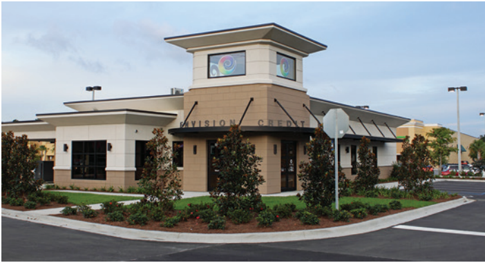
Killearn Financial Center

The wait is finally over! For the first time since the Credit Union's inception in 1954, members that either work or reside in the Killearn area are able to enjoy a full-service banking facility – located at 3519 Thomasville Road in the Publix shopping center. The new financial center opened on August 20 and offers several services to increase the level of convenience such as a drive-up ATM, safe deposit boxes, 24-hour vestibule access to a smart deposit ATM and nontraditional dialogue teller stations. Although the experience at this facility may be unfamiliar at first, our familiar and competent staff from the Wal-Mart North Financial Center – which closed on August 18 – is eagerly awaiting to assist with the transition.