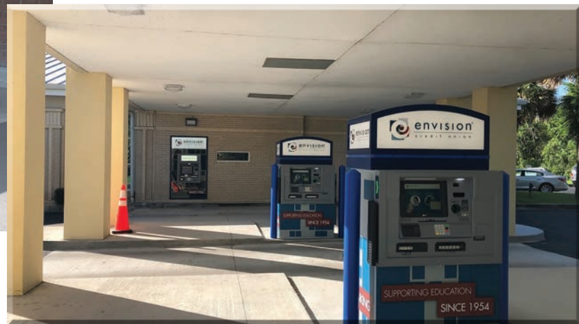
New ITM installation at our Chattahoochee Branch