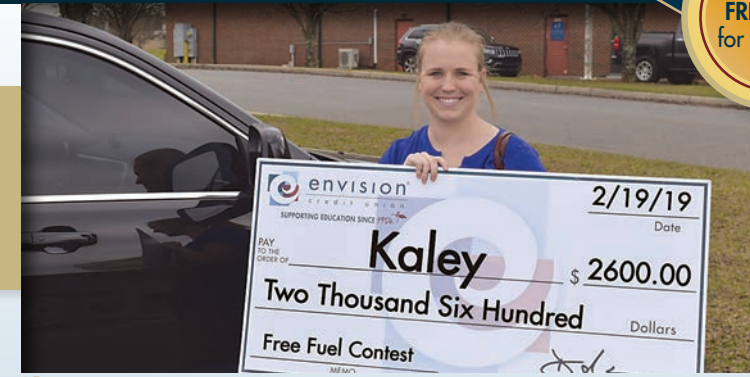
KALEY FREE FUEL FOR 2019