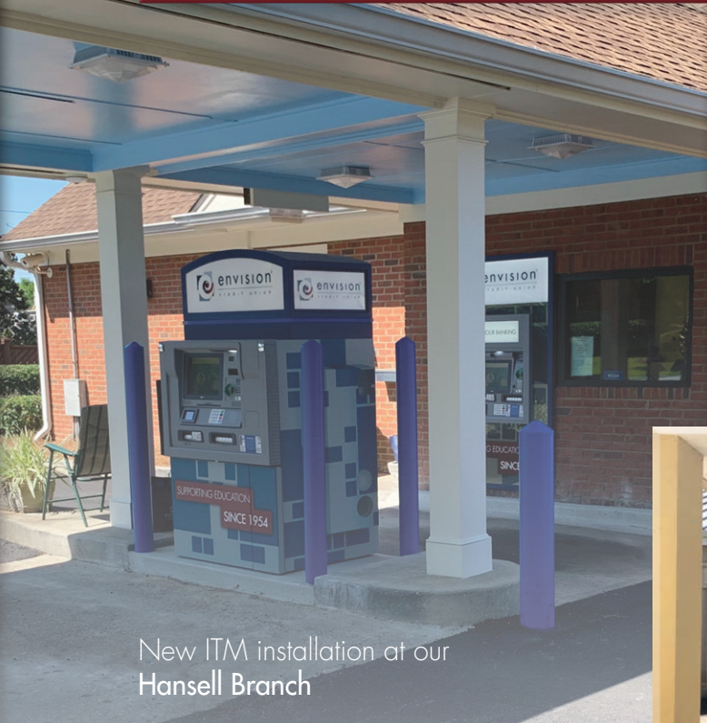
New ITM installation at our Hansell Branch

Here's a few details and tips to help you navigate our New Drive Thru Experience